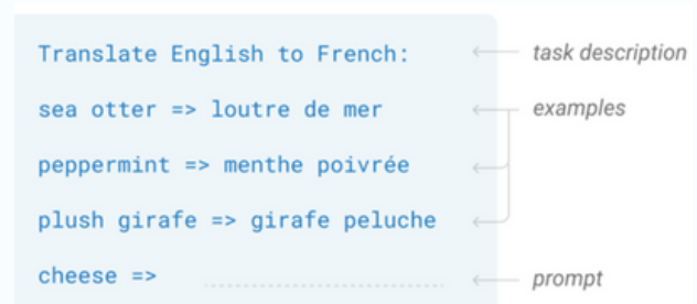
Figure 2: Example of a prompt

Through this approach, the burden of data collection, preprocessing, and annotation is greatly reduced and, in some cases, eliminated. This aspect is crucial to acknowledge, as these steps typically constitute a significant portion of the modeling task in terms of time and cost. The use of pre-trained models substantially alleviates these demands, streamlining the process of deploying ML solutions.